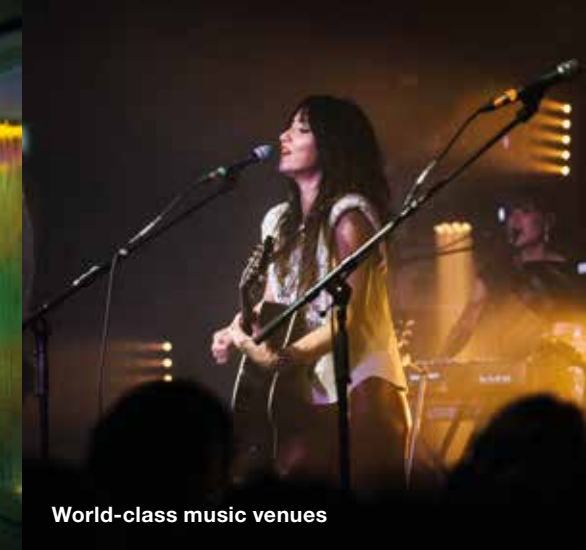
World-class music venues