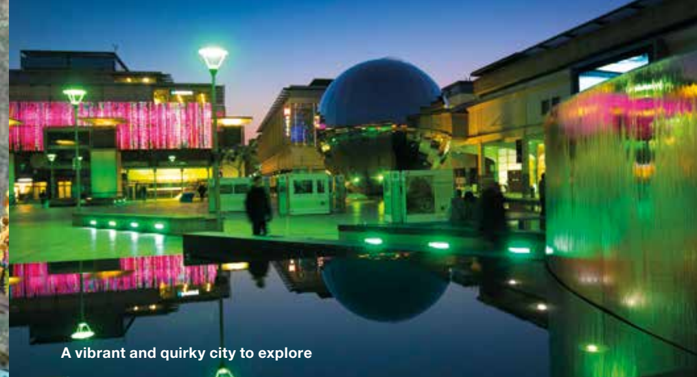
A vibrant and quirky city to explore