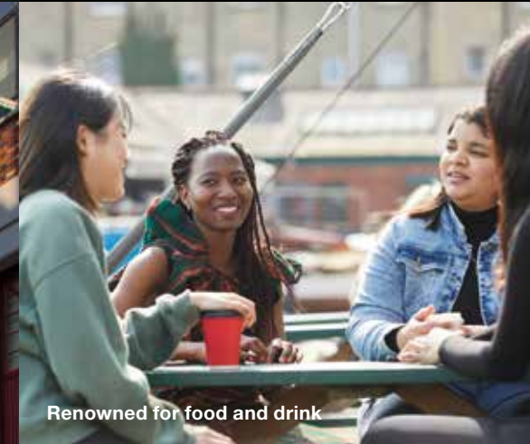
Renowned for food and drink