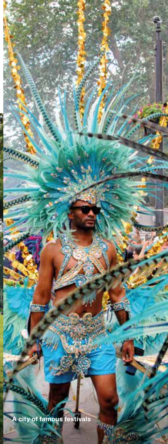
A city of famous festivals

Find more images of student life in our city @universityofbristol