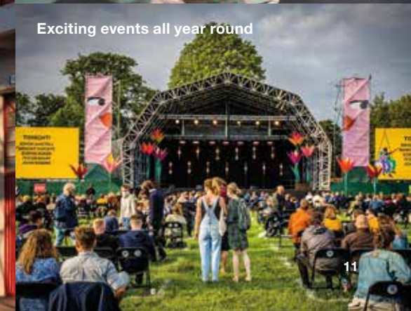
Exciting events all year round