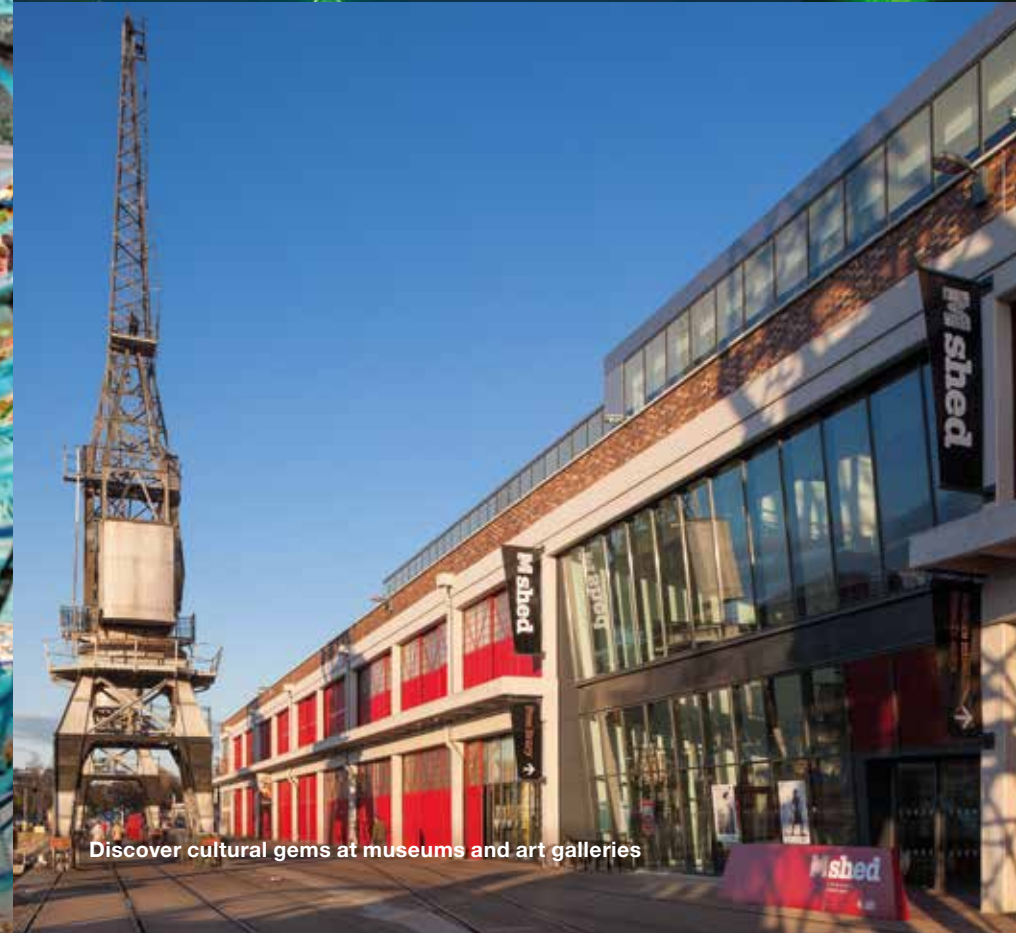
Discover cultural gems at museums and art galleries