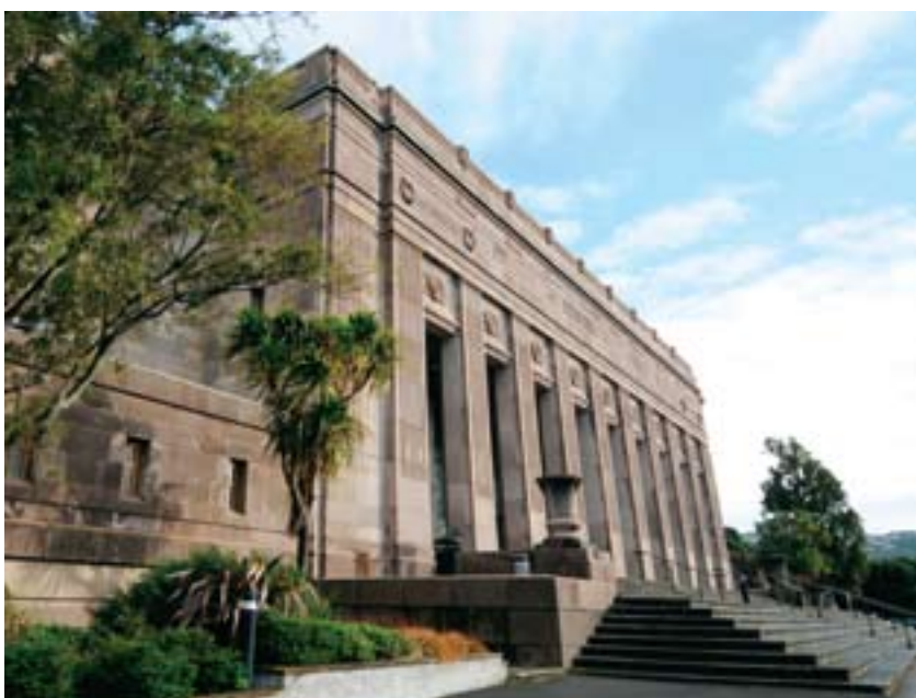
Dominion Building, centerpiece of the Massey Wellington campus

The Massey Wellington shines as a major research centre for the University and is also home to New Zealand's most distinguished School of Design. In addition, Massey University and Victoria University of Wellington have combined the strengths of their Conservatorium of Music and School of Music to establish Te Koki, the New Zealand School of Music.