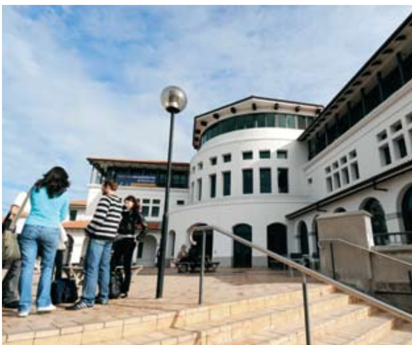
Atrium Building on the Massey Albany campus