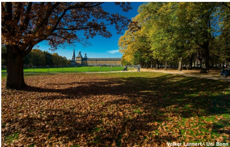
Volker Lannert/ Uni Bonn

There are also recycle bins for empty batteries in many dormitories and supermarkets.